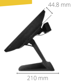
ROBUST YET SLIM