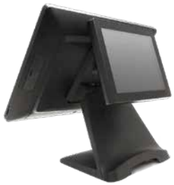
10.1" 2 nd Display