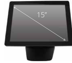
15" DISPLAY True Flat PCAP Touch Resolution 1024 x 768 Dimension 360 x 210 x 316 mm (14.2" x 8.3" x 12.4") Weight 5.4 kg (11.9 lbs)