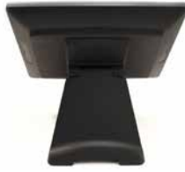
FANLESS DESIGN Reduce Noise And Prevent