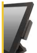
3 - Track MSR